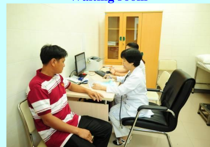
General Medicine Examination Room