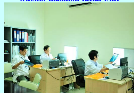
X-Ray Reading Room